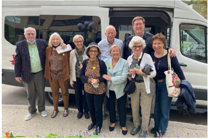
Heading out to the McMichael last fall.